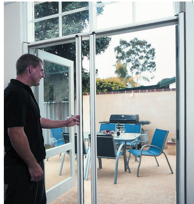
■ Easy-to-use tilt action patented Freedom™ Brake System.