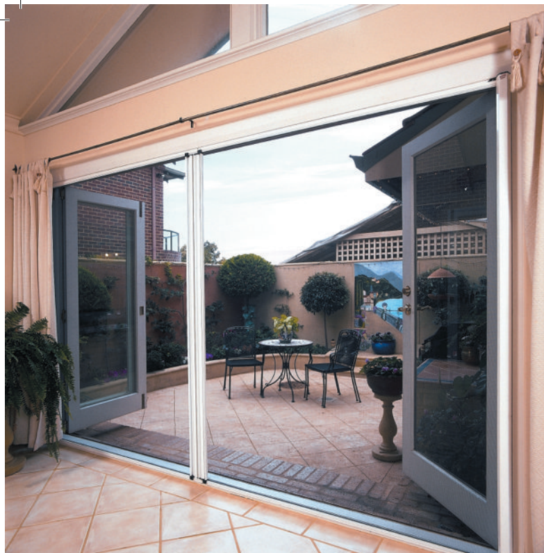
■ Freedom™ Elite is the perfect solution for smaller openings.