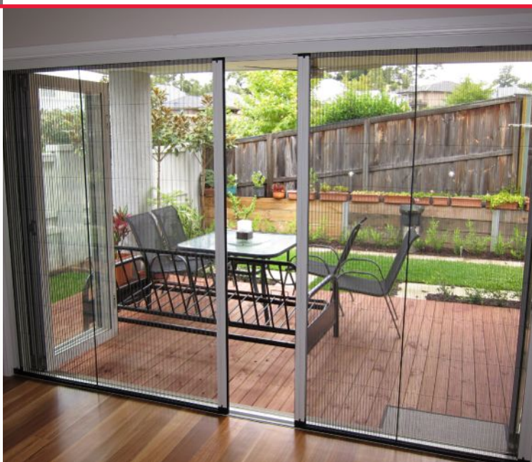
■ Elegant Pleated Screen spans to any width using the linked-panel connection system.